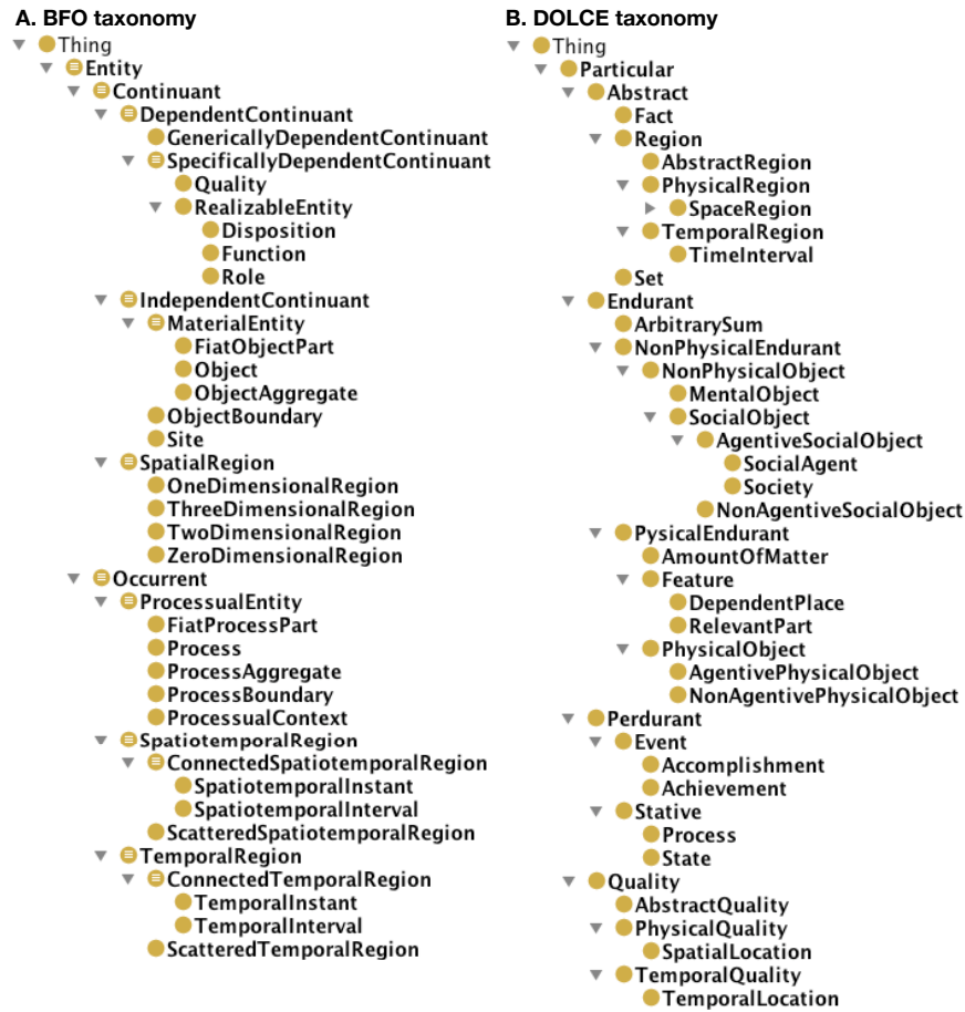
Fig. 1. Screenshots of the OWLized BFO and DOLCE taxonomies; for indicative purpose: Perdurant \approx Occurent, Endurant \approx IndependentContinuant, Quality \approx DependentContinuant.