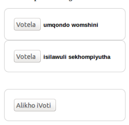
Figure 6: Crowdsourcing: Voting (Votela) for an isiZulu term for 'central processing unit' or vote for neither of them (button with Alikho iVoti). (screenshot of the beta version of the tool)