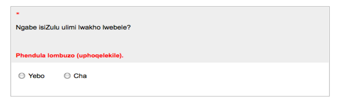
Figure 4: The question that was mandatory, now with explanatory text in addition to the red asterisk.

The response rate was very low for both surveys: 12 IDs were generated in the term-survey, of which one incomplete but with some responses and one successfully completed, and 16 IDs were generated for the picture-survey, of which one incomplete and only one term, and two completed. 44 terms have one or more isiZulu term proposed for it—21 times for the term-survey and 37 times for the picture-survey—of which 15 more than one; this set is included in Table 4 in the appendix. The entities for which no term was proposed are: network interface card, bit, cloud computing, terabyte, softcopy, and hacker. Given the low response rates, there is insufficient data to falsify or validate the experiment's hypothesis.