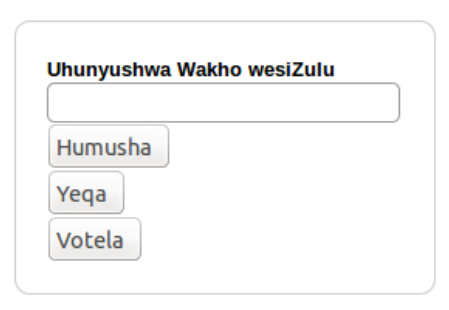
Figure 5: Crowdsourcing: Propose a translation for 'central processing unit', Skip, or Vote, respectively (screenshot of the beta version of the tool).

Kuqubeka Umdlalo Wokuhunyushwa Wabantu Ababili : iVoti